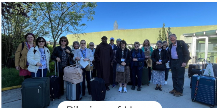
Pilgrims of Hope

As our pilgrimage continued into its 5th day, we were filled with anticipation of the sacred experiences that awaited us!