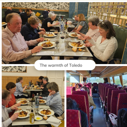
The warmth of Toledo

We were excited when the coach neared Toledo and after a short walk from the drop off point, happily checked into our lovely rooms. As evening fell, we gathered for a delicious dinner at the hotel restaurant, sharing stories and laughter as we reflected on the day's experiences.